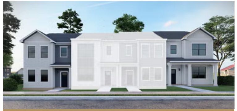
Highland with 2-Car Garage