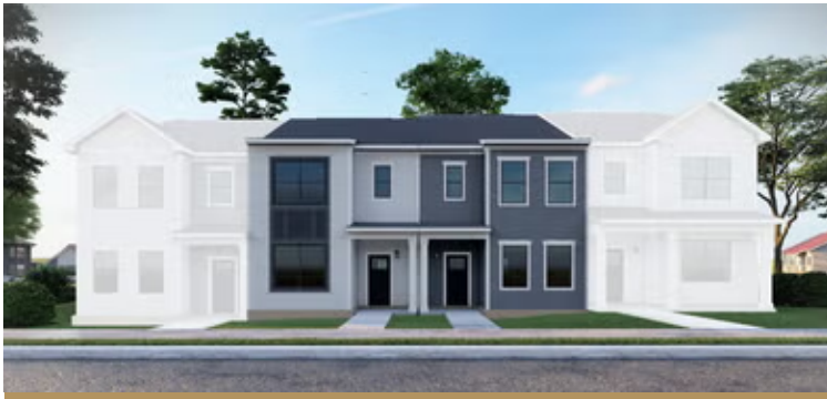
Millcreek with 2-Car Garage