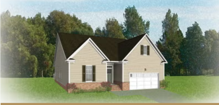
Corvallis Starting at $519,000 🏠 2,106 🛏️ 3 - 5 🚗 2 - 3