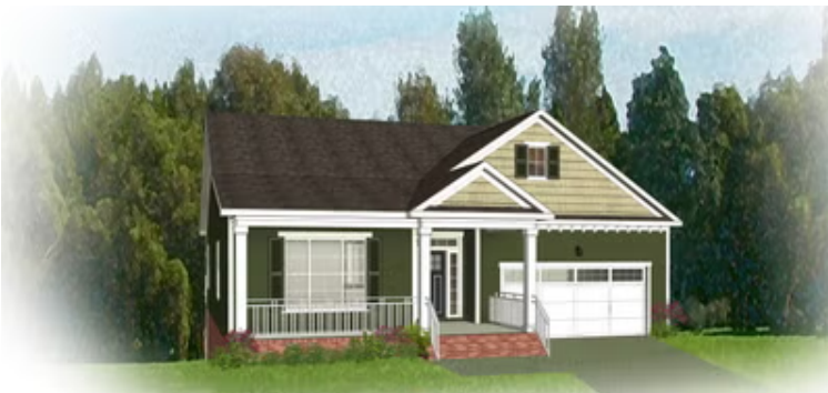
Hartford Terrace Starting at $601,000 🏠 3,044 🛏️ 3 - 4 🚗 2.5