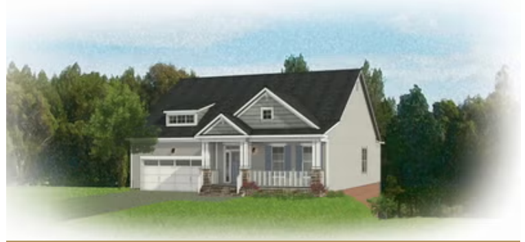
Linden Terrace Starting at $586,900 🏠 2,918 🛏️ 3 🚗 2.5