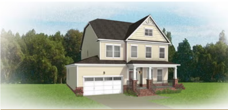
Savannah Starting at $534,600 🏠 2,842 🛏️ 4 - 5 🚗 2.5 - 3