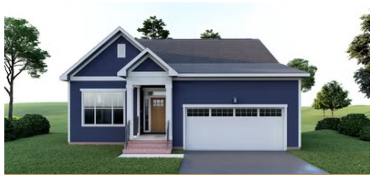
Pearl Terrace Starting at $534,900 🏠 2,170 🛏 3 🚗 2.5