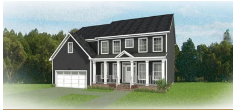
Bradford Starting at $526,900 🏠 2,706 🛏 4 🚗 2.5