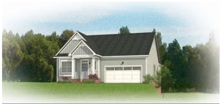
Belmont Terrace Starting at $550,000 🏠 1,806 🛏️ 2 - 4 🚗 2.5 - 3