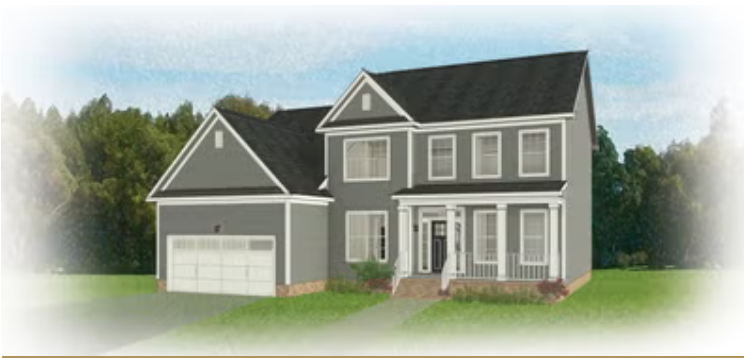
Westminster Starting at $527,400 🏠 2,641 🛏️ 3 - 5 🚗 2.5 - 3