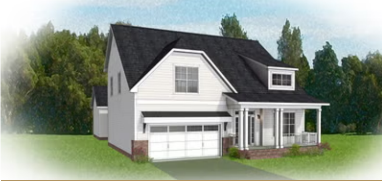
Carlisle Starting at $579,300 🏠 2,873 🛏️ 3 - 4 🚗 2.5 - 3